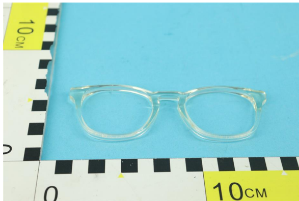
Original sample A